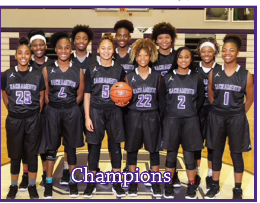
Five Time CIF Sac Joaquin DII & DIII Section Champions.

has taught me to be positive, responsible, and hold myself accountable for doing my best on and off the court." 3.7 GPA